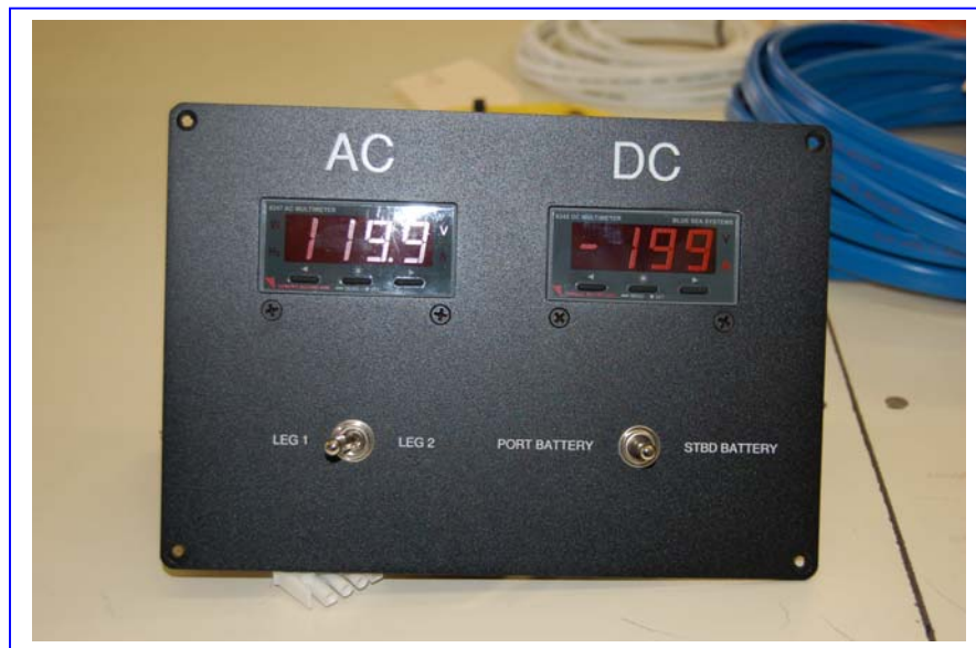
Figure 2 AC/DC Meter Panel