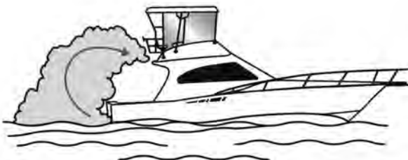
Figure 3. When protective weather coverings are in place, engine or generator exhaust from your yacht, while docked and/or running, can cause excessive accumulation of Carbon Monoxide gas within the cabin and cockpit areas of your yacht. Always provide adequate ventilation when the weather coverings are in place and either the engine or generator are running.