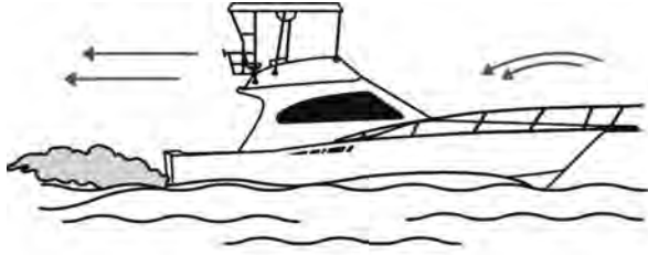
Figure 4. Engine or generator exhaust from your yacht while underway and operating with a high bow angle can cause excessive accumulation of Carbon Monoxide gas within the cabin and cockpit areas of your yacht. Always provide adequate ventilation and redistribute the load to lower the bow angle.