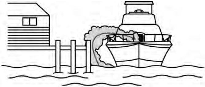
Figure 1. Blocked hull exhaust outlets near a pier, dock, seawall, bulkhead or any other structure can cause excessive accumulation of Carbon Monoxide gas with the cabin areas of your yacht. Be certain hull exhaust outlets are not blocked in any way.

The following illustrations show some of the ways that carbon monoxide gas can accumulate in your boat while you are at the dock or underway. Become familiar with these examples to prevent exposure to this poisonous gas.