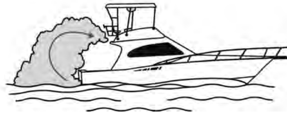
Figure 5. Engine or generator exhaust from your yacht while underway at a slow speed can cause excessive accumulation of Carbon Monoxide gas within the cabin and cockpit areas of your yacht. A tail wind can increase the accumulation. This is often referred to as the “station wagon effect”. Always provide adequate ventilation or increase your speed if possible.