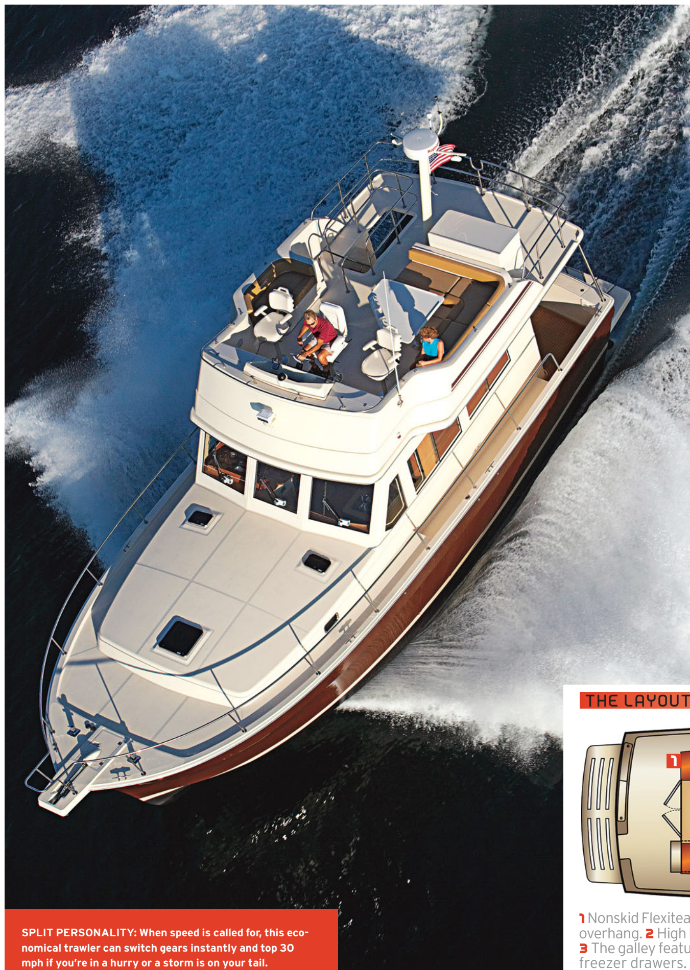
SPLIT PERSONALITY: When speed is called for, this economical trawler can switch gears instantly and top 30 mph if you're in a hurry or a storm is on your tail.

Like the classic trawler wheel at the lower helm, everything about the 43 Trawler is oversized, including the engine room (accessed from the aft deck), where there's a 360-degree workspace around the 8.0-kW genset. In addition, the engine intakes are both fitted with crash pumps. All strainers and pick-ups are labeled and the single fuel tank has a sight gauge. ZF V-drives free up more